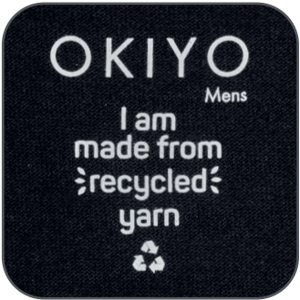
INNER NECK LABEL

Our SUSTAINABLE GOLF SHIRTS are the perfect blend of style, comfort, and environmental responsibility. Made from ECO-FRIENDLY MATERIALS , these shirts not only look great but also REDUCE THEIR IMPACT on the planet.