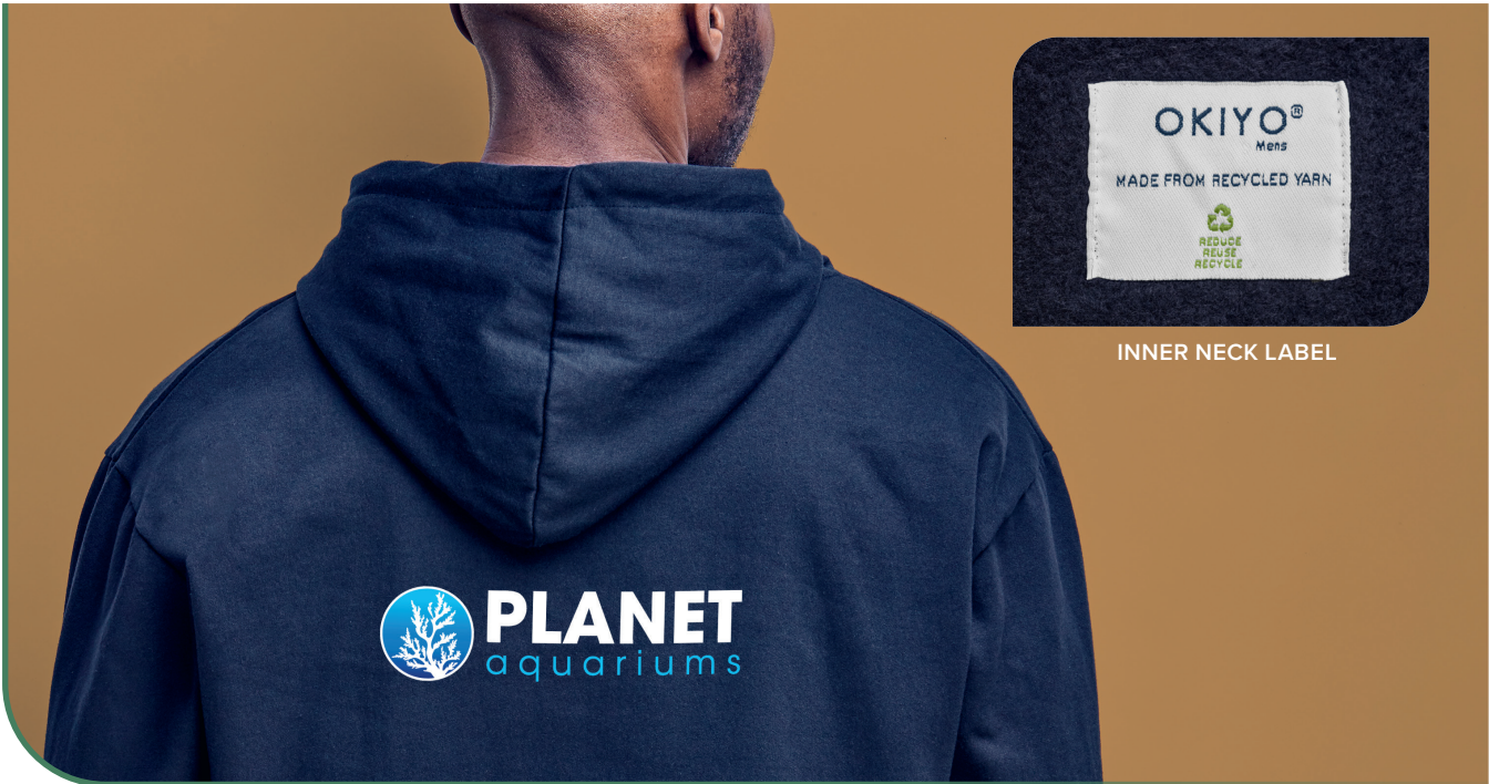
HL-OK-16-A & HL-OK-17-A ARE AVAILABLE IN THE 3 COLOURS SHOWN ON THIS PAGE

This eco-friendly Hooded Sweater is made using SUSTAINABLE or RECYCLED MATERIALS , ensuring a reduced carbon footprint and a positive impact on the environment.