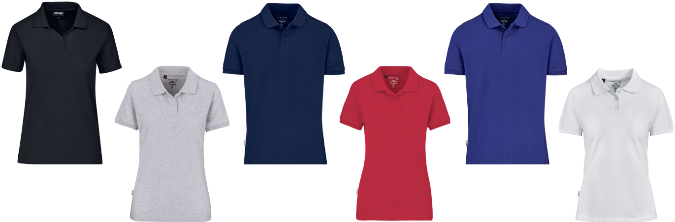
GS-OK-259-A & GS-OK-260-A ARE AVAILABLE IN THE 6 COLOURS SHOWN ON THIS PAGE

Our SUSTAINABLE GOLF SHIRTS are the perfect blend of style, comfort, and environmental responsibility. Made from ECO-FRIENDLY MATERIALS , these shirts not only look great but also REDUCE THEIR IMPACT on the planet.